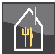
Restaurants and pubs